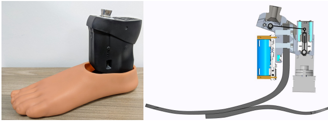
Fig. 1. The left image shows the resulting ankle prosthesis mounted on a high-profile ESAR foot. The right image presents a 2D-cross section of the assembly where it is possible to see the internal structure as well as a superimposed kinematic model.

The actuator is fitted on a high-profile energy storing and restitution (ESAR) prosthetic foot. Utilizing a high-profile foot guarantees an higher elasticity of the foot, thus producing a larger range of motion (ROM) and a higher energy storage that helps in downsizing the actuating unit. It is important to underline that such design doesn't guarantee an active propulsion of the patient during gait, which would otherwise have required a more powerful actuation.